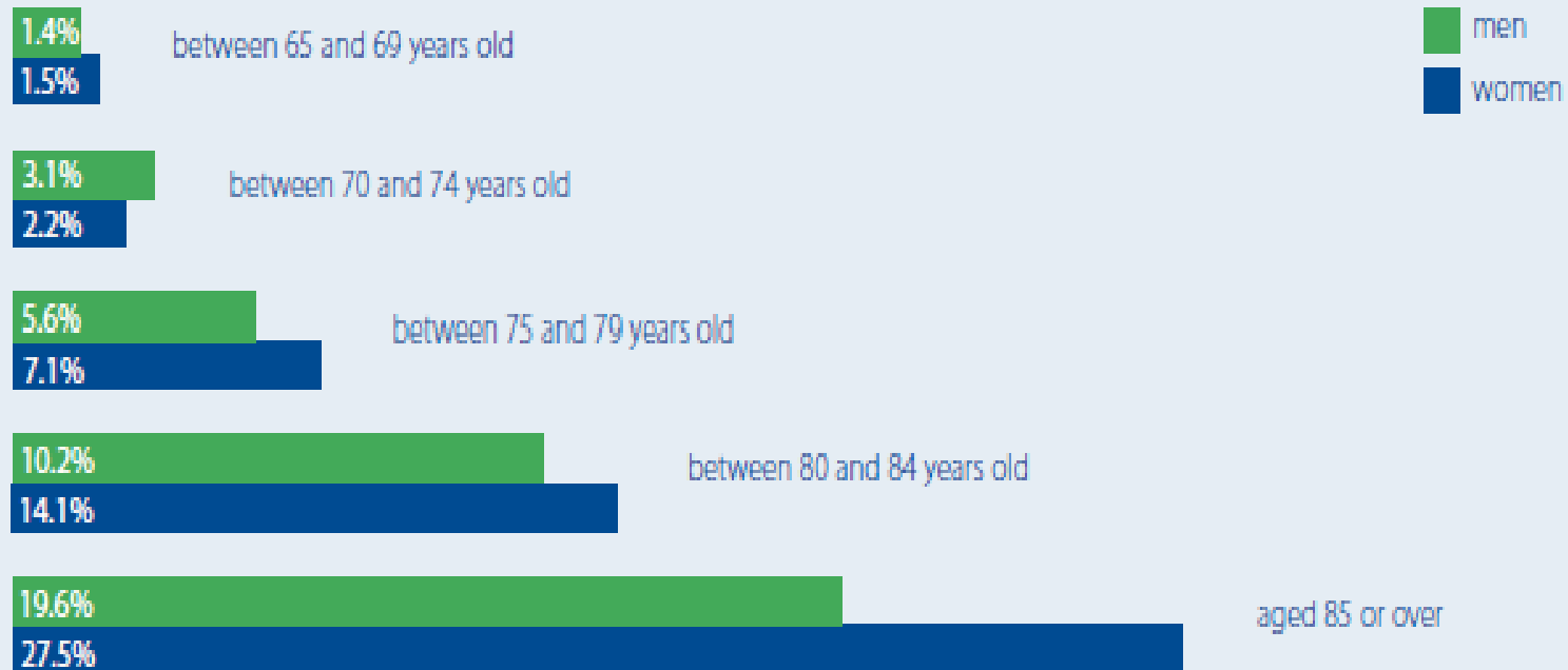
Figure 1. Occurrence of dementia in people over 65